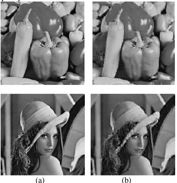
Figure 2 : Visual quality comparisons with measurement rate equaling to 0.4 and block size of 8×8. "(a) Original image, (b) reconstruction image by CRP-based CS method.

Compressive sensing (CS) is a novel theory framework for signal acquisition, which has been widely concerned in many application fields. A new scheme for block CS image compression applications, in which a method of coefficients random permutations (CRP) in transform domain is exploited for optimal sampling of CS, considering the fact that the image blocks with different spatial characteristics have different sparsity or random compressibility [12]. The proposed permutations technique makes the sparsity of all the sampled coefficients vectors more evenly, which results in requiring approximate equal number of measurement for well restoration. New results show that our proposed scheme can efficiently enhance the CS performance in increasing reconstructed image quality or reduce the measurement ratio.